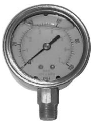
1/4" Bottom Fitting, High Pressure, Stainless Steel Case, Liquid Filled, Chemical Gauges