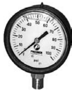
1/4" Bottom Fitting ABS Plastic Case Chemical Gauges

WARNING: BRASS STEM GAUGES ARE NOT TO BE USED WITH AMMONIA